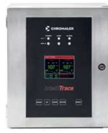
CONTROLS & ACCESSORIES