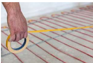
ELECTRIC FLOOR HEATING