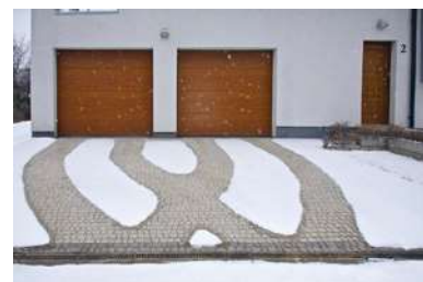
RESIDENTIAL DRIVEWAY SNOW MELTING