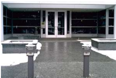
CONCRETE SNOW MELTING