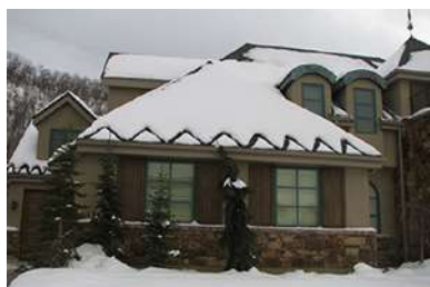
ROOF & GUTTER DEICING

Liberty Electric Products designs, stocks, and distributes a complete line of heat trace cables and products for freeze protection and process temperature maintenance for a wide range of industrial, commercial, and residential applications. We can specify and provide industrial/commercial heat trace for freeze protection and process temperature maintenance, commercial/residential heat trace cables for applications such as freeze protection, snow melting, frost heave prevention, hot water temperature maintenance, and roof/gutter deicing.