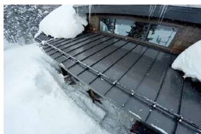
LOW-VOLTAGE SNOW MELTING