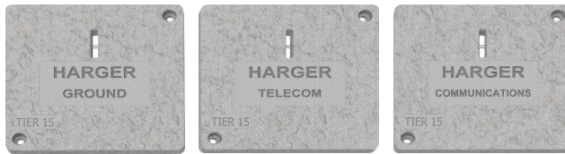
Standard Lid Engraving