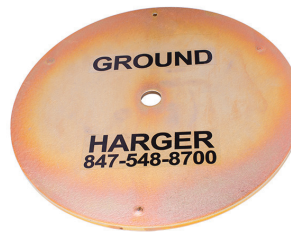
Top View of Cover