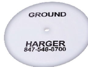
Top View of Cover

• Manufactured from High Density Polyethylene.