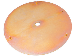
Inverted View of Cover

• Manufactured from 3/16" commercial grade steel with a zinc/ultraseal coating.