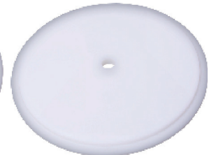
Inverted View of Cover